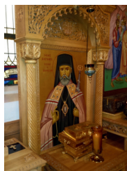
St. Raphael of Brookline