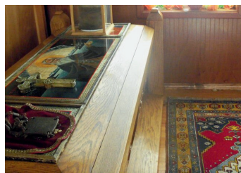
St. Herman of Alaska