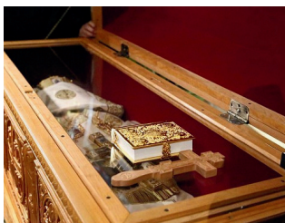
St. Mardarije of Libertyville